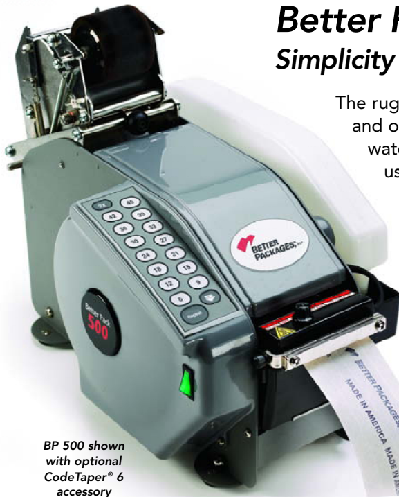
BP 500 shown with optional CodeTaper® 6 accessory

The rugged Better Pack 500 offers straightforward operation and one-touch dispensing of reinforced and non-reinforced water-activated tape. Engineered for durability, ease of use and safety, this electronic, tabletop workhorse stands up to rough handling and harsh conditions in most work settings. Fast and reliable, the Better Pack 500 will improve the efficiency and speed of operations with medium- to high-volume packaging needs.