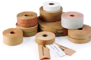
BetterSeal Secure® Tape, available in a wide range of SKUs