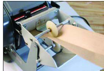
Tape Aerial conveniently holds tape in upright position