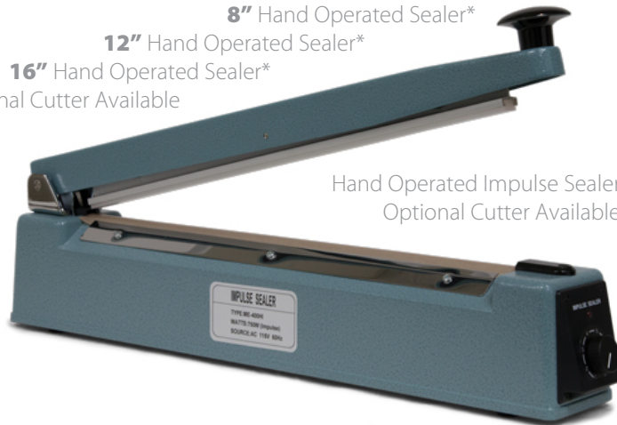
Hand Operated Impulse Sealer Optional Cutter Available